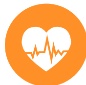
An Exceptional Quality of Life