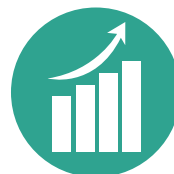
A Vibrant and Growing Economy