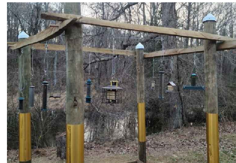
9 PROPOSED BIRD FEEDING STATION