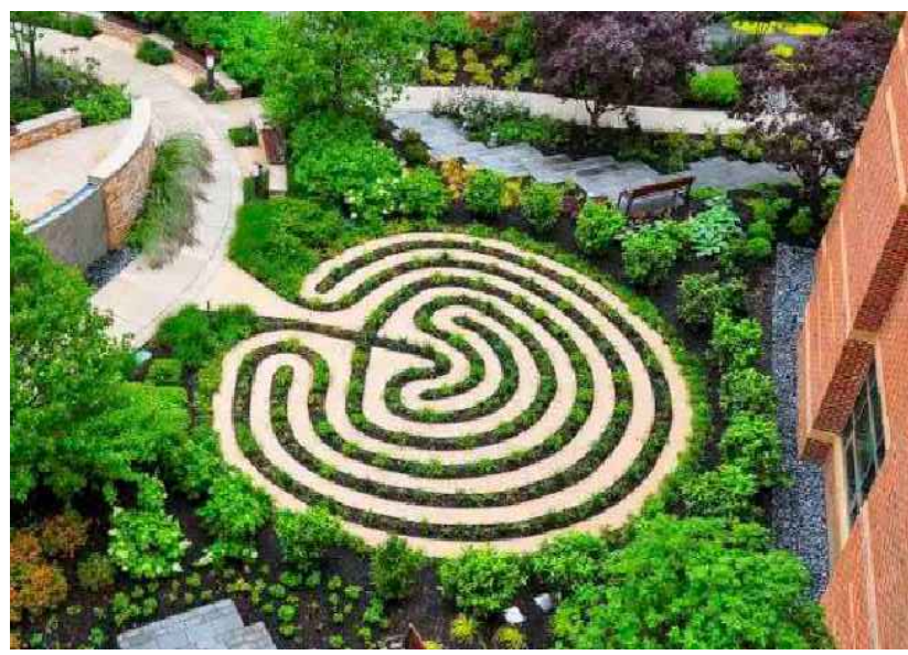
16 SENSORY WALK (VISION)