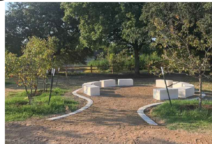
5 POTENTIAL SCHOOL CONNECTION