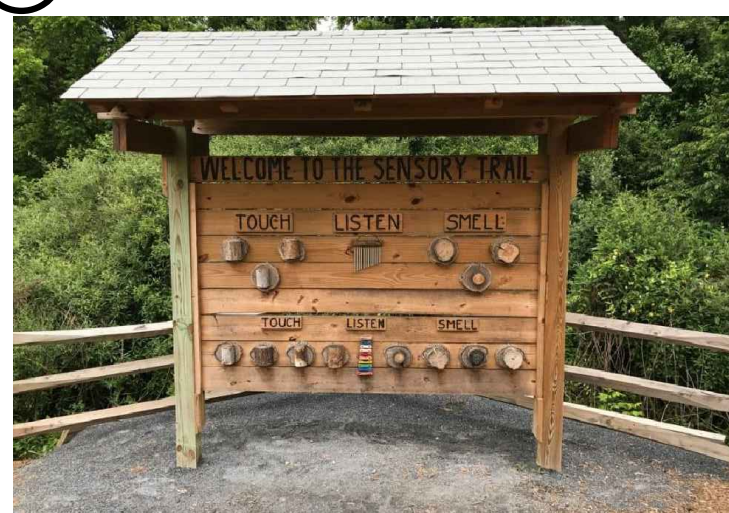
18 SENSORY TRAIL MAP