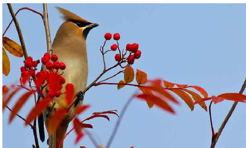
13 PROPOSED FRUIT BEARING TREE