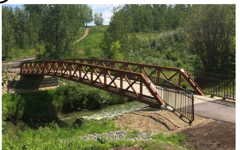
6 PROPOSED PEDESTRIAN BRIDGE