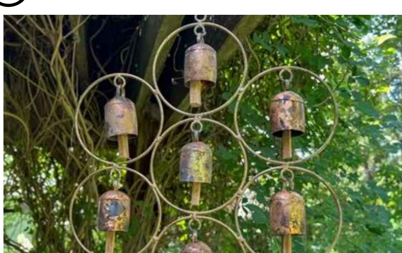
12 PROPOSED WIND CHIMES