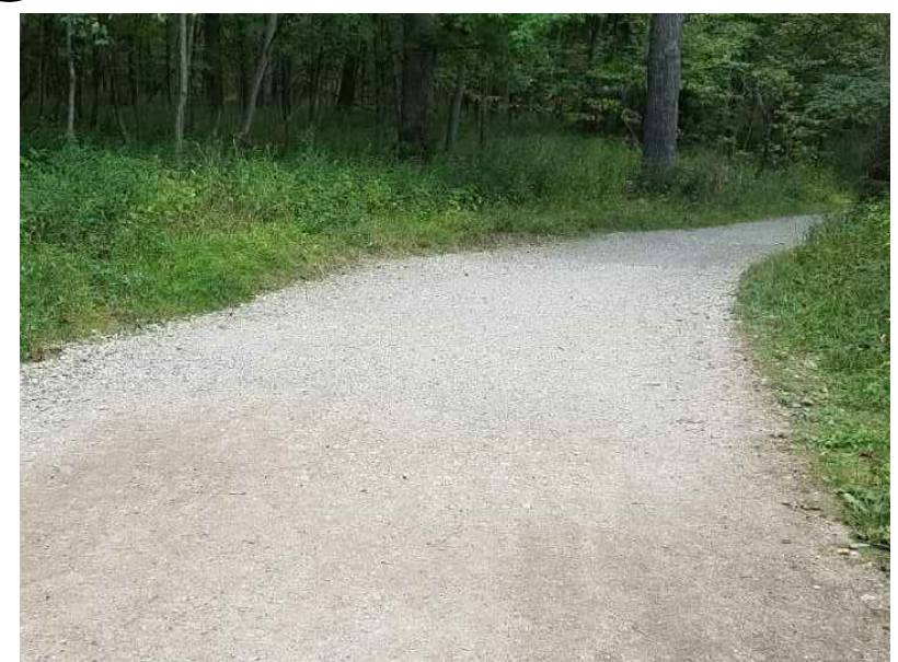
4 PROPOSED NATURAL PATH