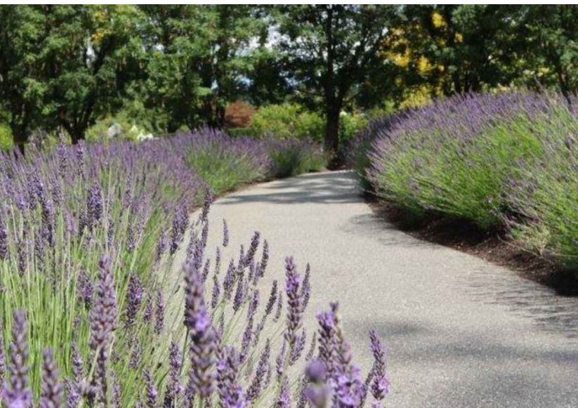
15 SENSORY WALK ( SMELL )