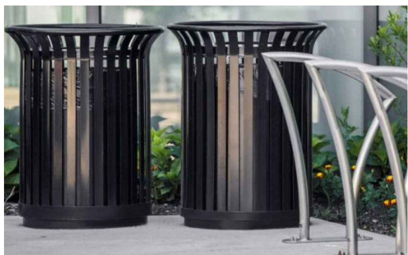
7 PROPOSED WASTE RECEPTACLE