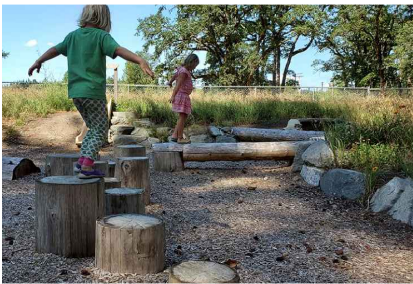
3 PROPOSED NATURAL PLAY