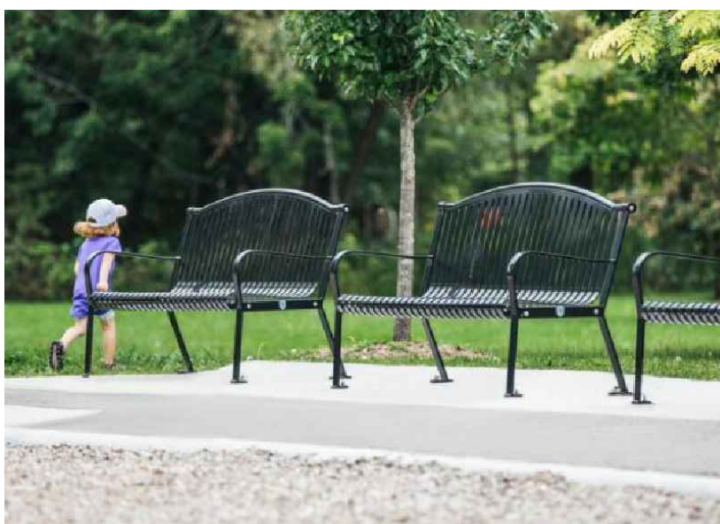
8 PROPOSED SEATING / VIEWING