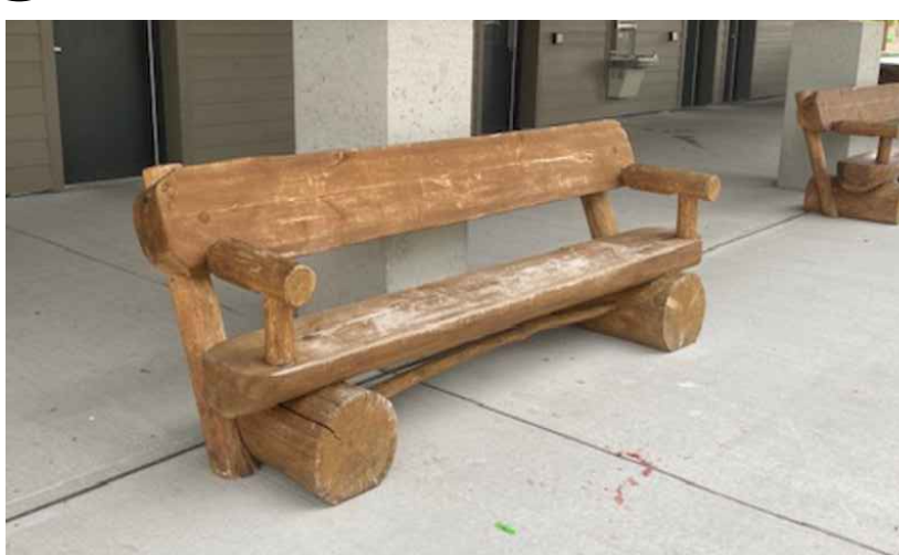
11 PROPOSED NATURAL SEATING