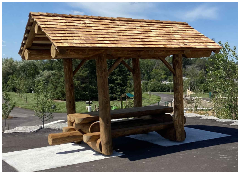
2 PROPOSED NATURAL COVERED SEATING