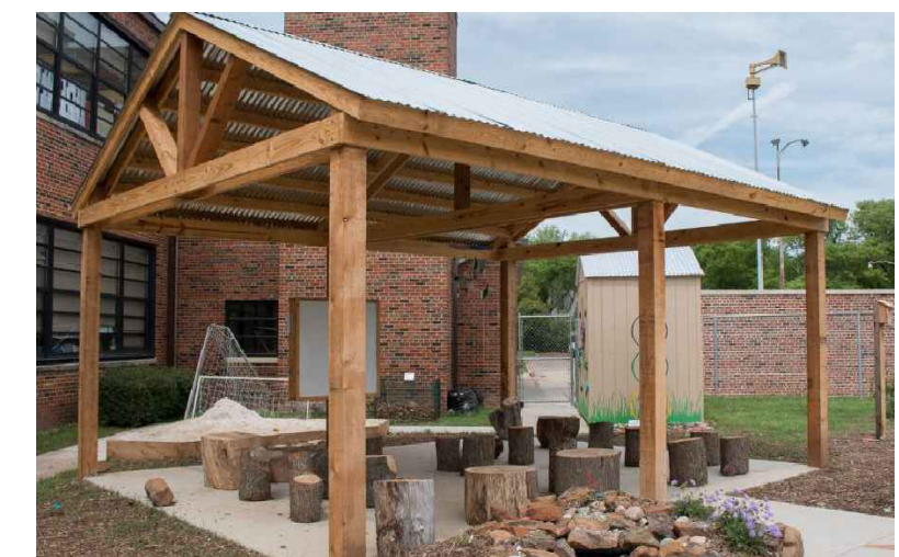
1 PROPOSED LEARNING SHELTER