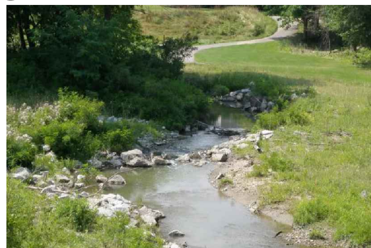
17 SENSORY WALK (SOUND)