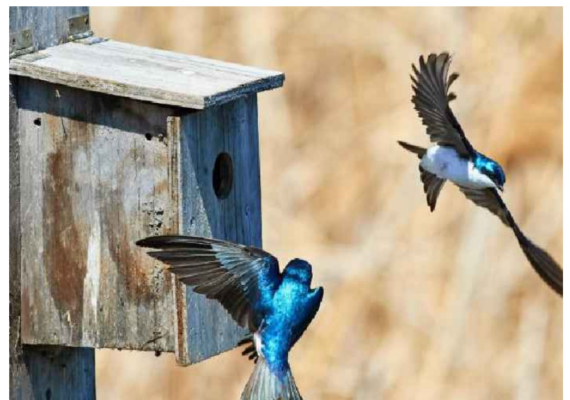
10 PROPOSED BIRD HOUSE