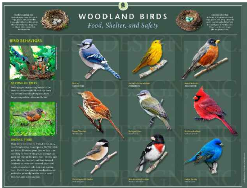
14 PROPOSED INTERPRETIVE SIGN